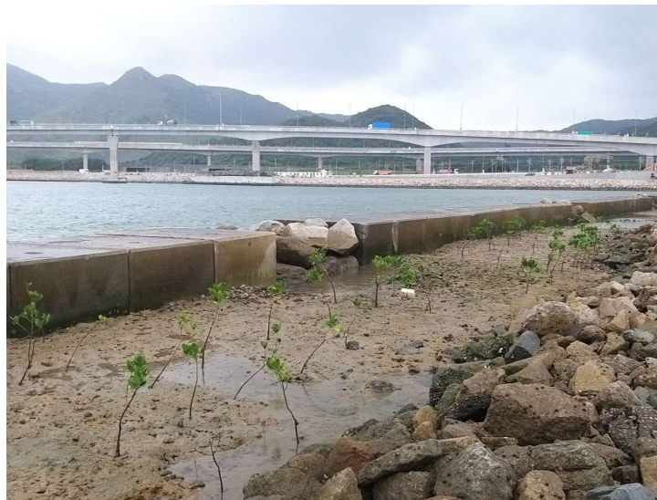
General View of Mangrove Eco-shoreline at Lower Terrace