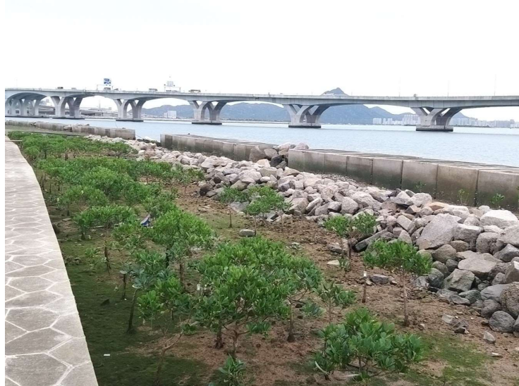
General View of Mangrove Eco-shoreline at Upper Terrace