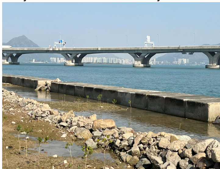
General View of Mangrove Eco-shoreline at Lower Terrace