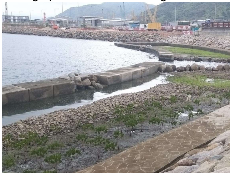
General View of Mangrove Eco-shoreline at Upper Terrace