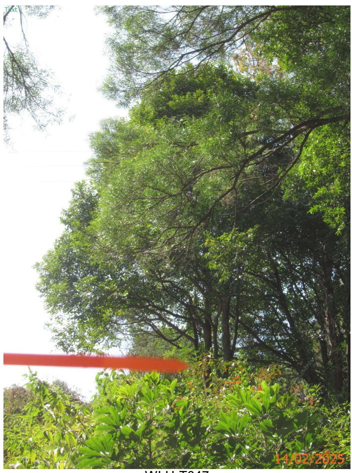
WLH-T047 Aquilaria sinensis Observed since November 2023