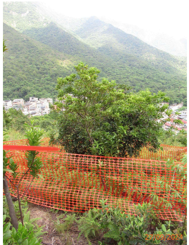
R04 Enkianthus quinqueflorus Observed since November 2023