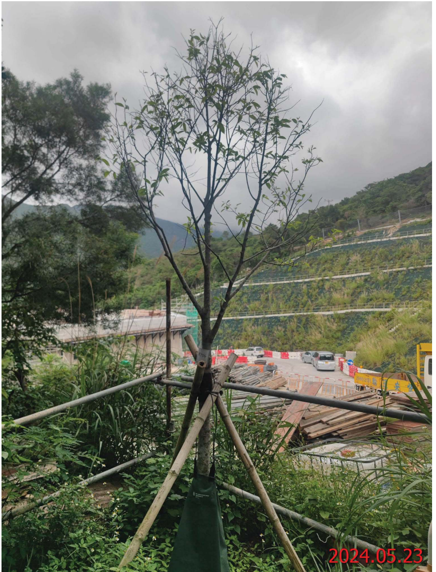
RP04-Whole view of tree