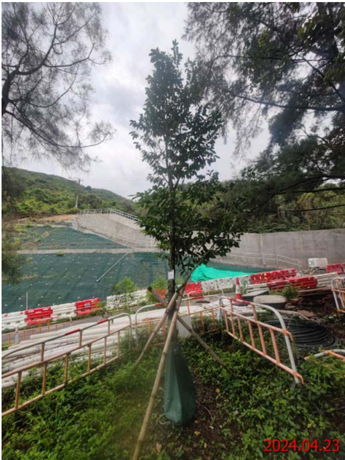
RP01-Whole view of tree