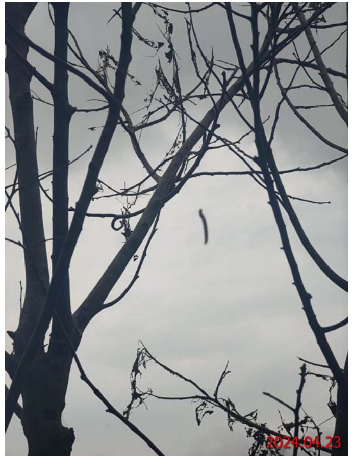
RP04-Severe defoliation on Tree crown-2