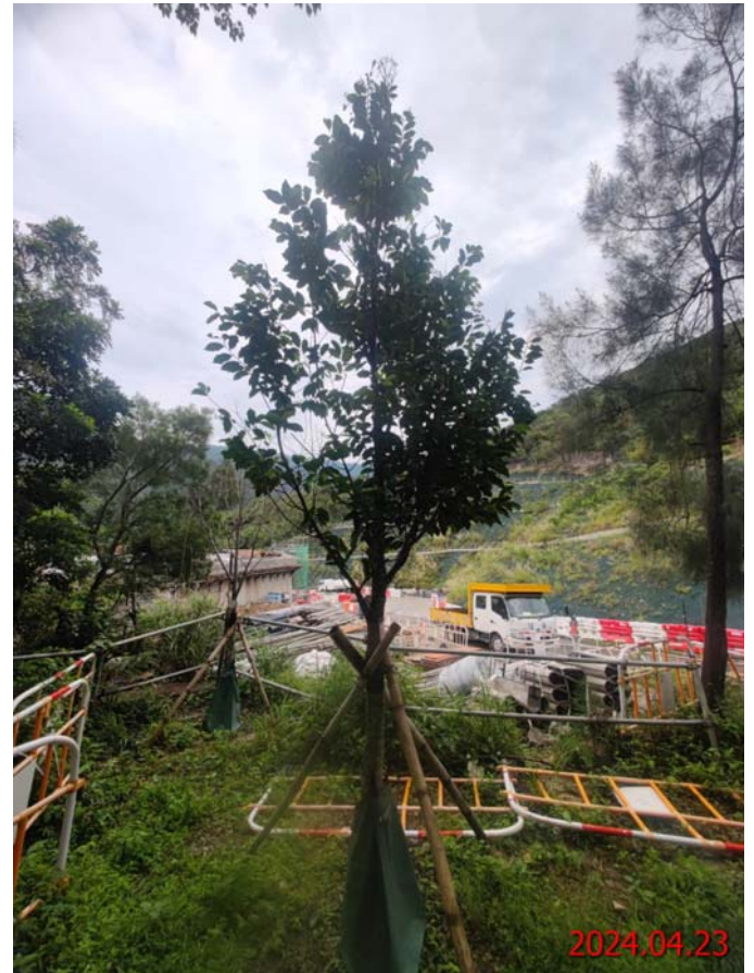
RP02-Pest observed on Tree branch