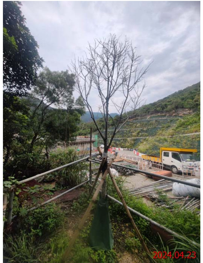
RP04-Sign of pest infestation on Tree branch-2