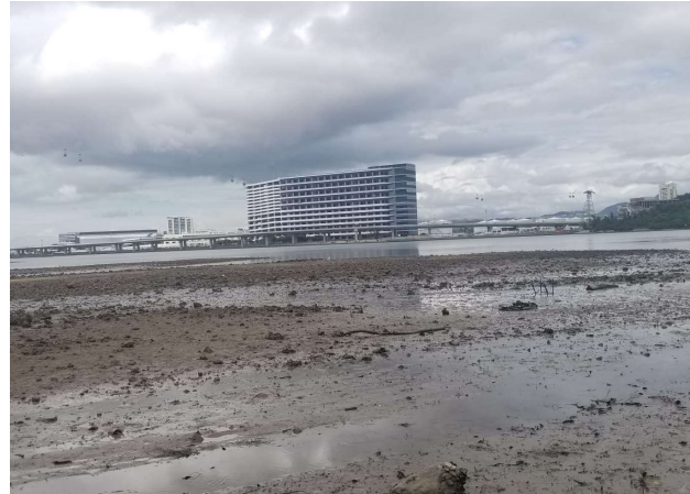
(b) Survey Location at TCB2