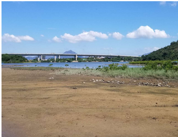
(d) Survey Location at THW