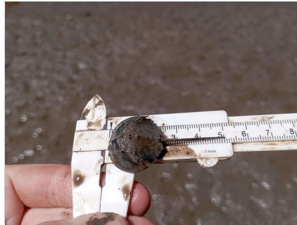
(e) Horseshoe crab Tachypleus tridentatus recorded at THW during the Qualitative Walk-through Survey