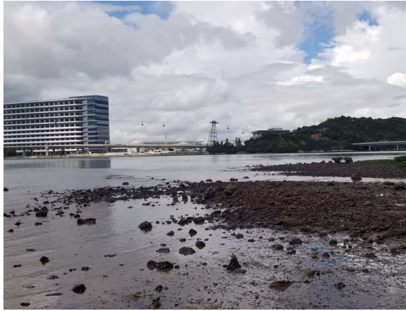
(a) Survey Location at TCB1