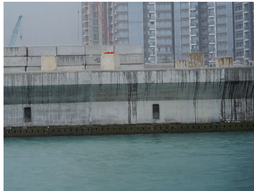
General View of Vertical Eco-shoreline