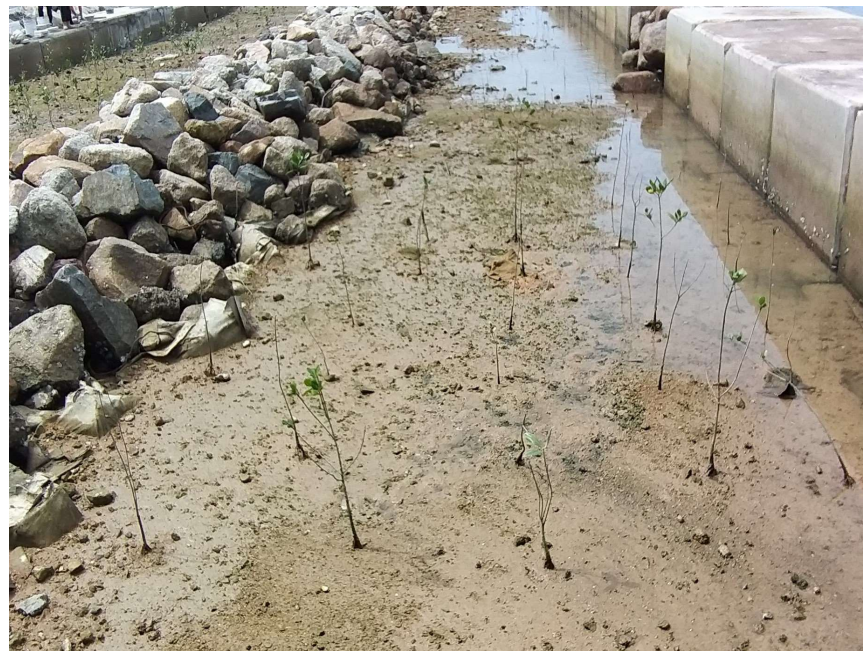
General View of Mangrove Eco-shoreline Lower Terrace