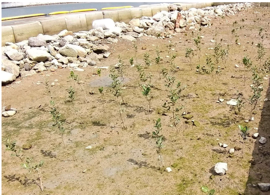
General View of Mangrove Eco-shoreline Upper Terrace