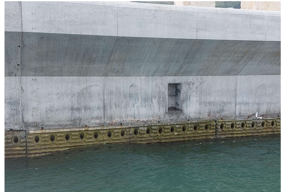
General View of Vertical Eco-shoreline