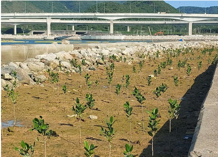
General View of Mangrove Eco-shoreline Upper Terrace