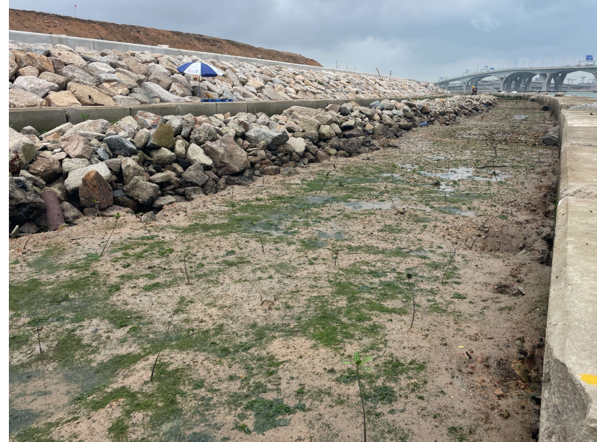
General View of Mangrove Eco-shoreline Lower Terrace