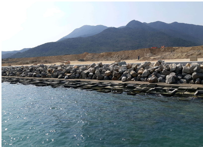
General View of Rocky Eco-shoreline