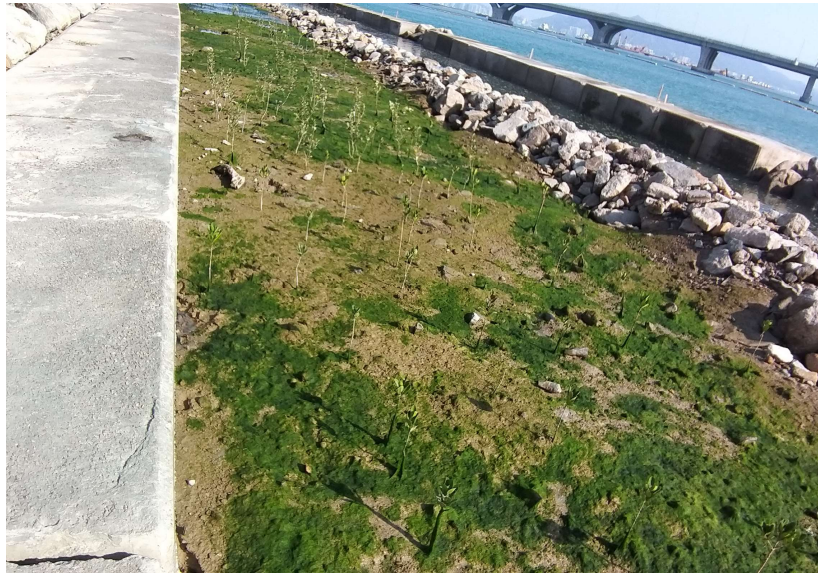
General View of Mangrove Eco-shoreline