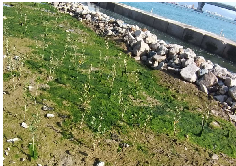
Close Up of Mangrove Eco-shoreline