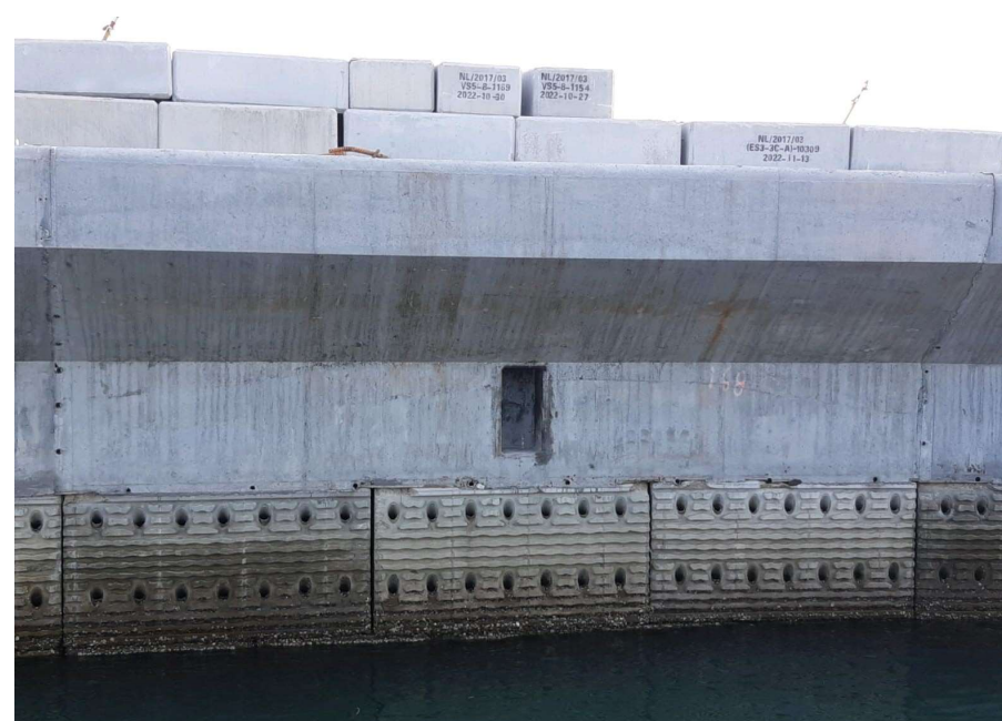
General View of Vertical Eco-shoreline