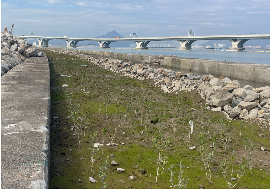
General View of Mangrove Eco-shoreline