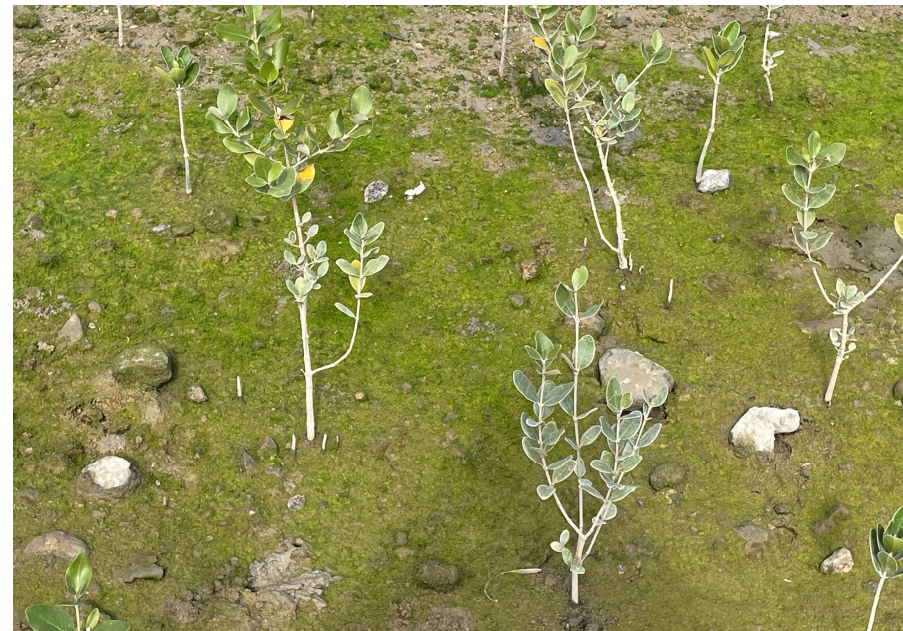
Close Up of Mangrove Eco-shoreline