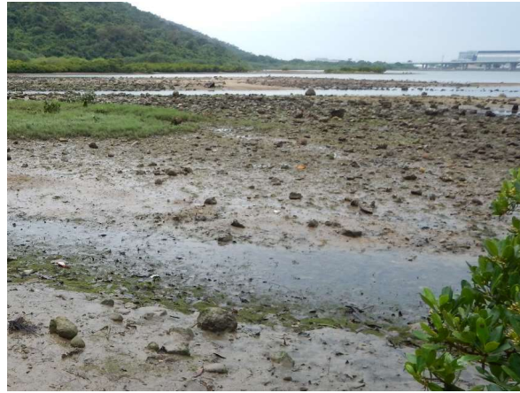
(b) Survey Location at TCB2