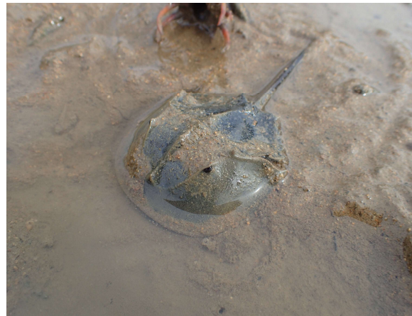
(e) Horseshoe crabs Tachypleus tridentatus recorded at TCB1 during the Qualitative Walk-through Survey