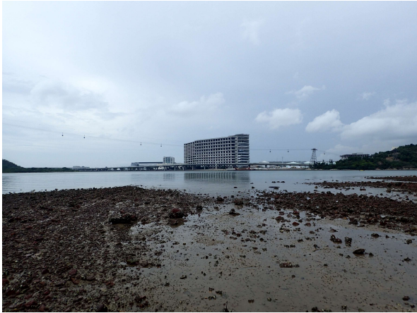
(a) Survey Location at TCB1