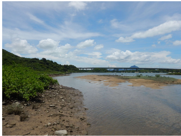
(d) Survey Location at THW