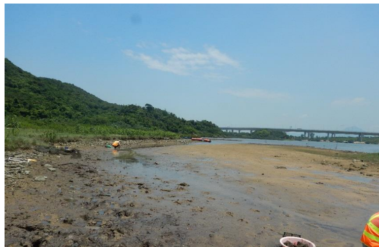
(d) Survey Location at THW