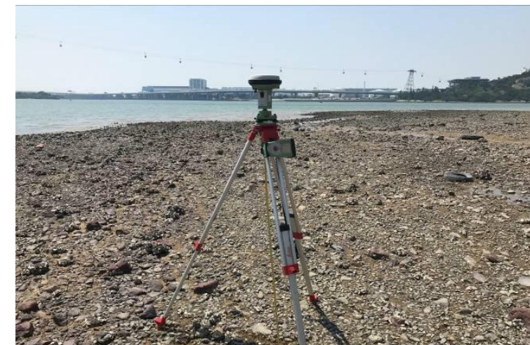
(f) Sedimentation Rate Monitoring