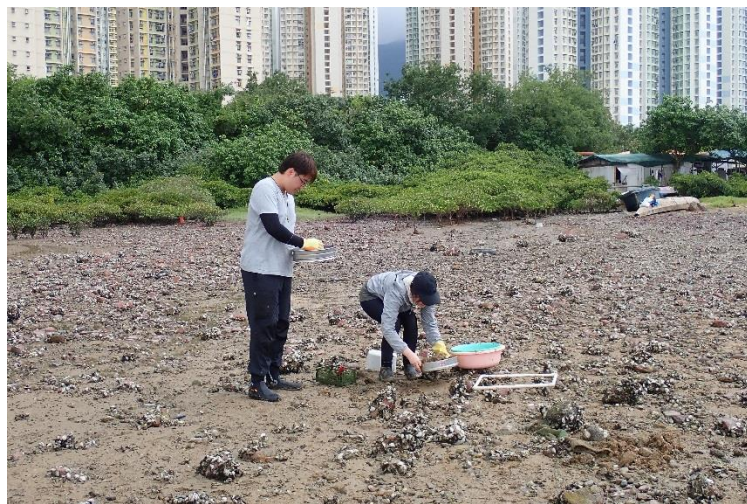
(a) Survey Location at TCB1