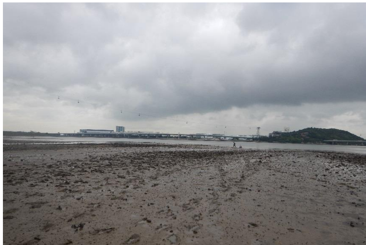
(b) Survey Location at TCB2